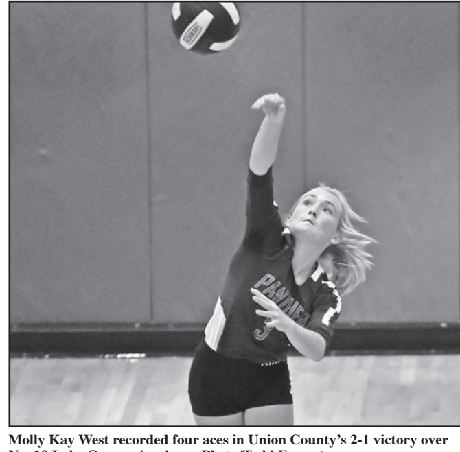
No. 10 Lake Oconee Academy.

'We struggled with communication in the second set "Commerce is a young and it showed in the amount of errors that we had. We had a lot to overcome and I'm glad we came out with a W." Later, Union remained