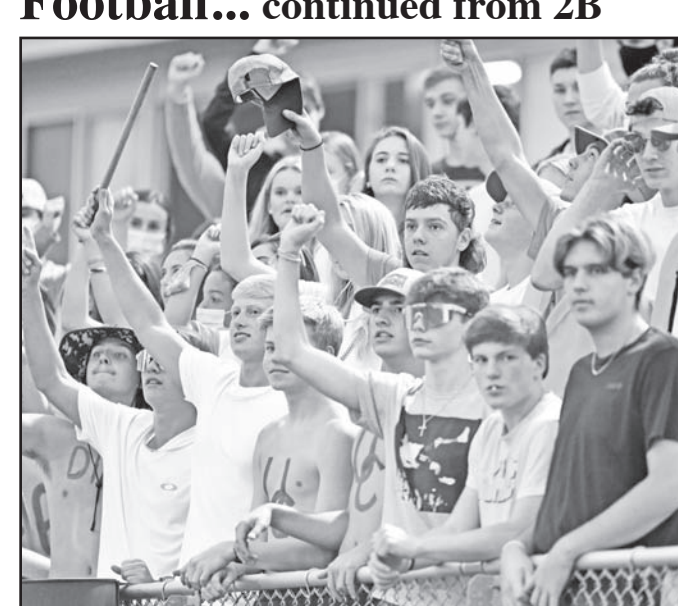
The Union County High School student section are vocal supporters of Panthers football on Friday nights. for nearly three hours," Al-